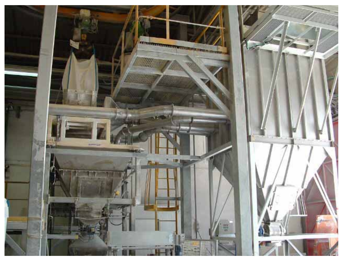
Big Bag discharge system of adipic acid dust made of ss316