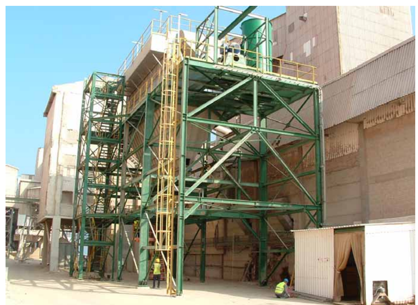
Potash Unloading pit Ashdod port 110,000 m³ /h - Under Construction September 2008