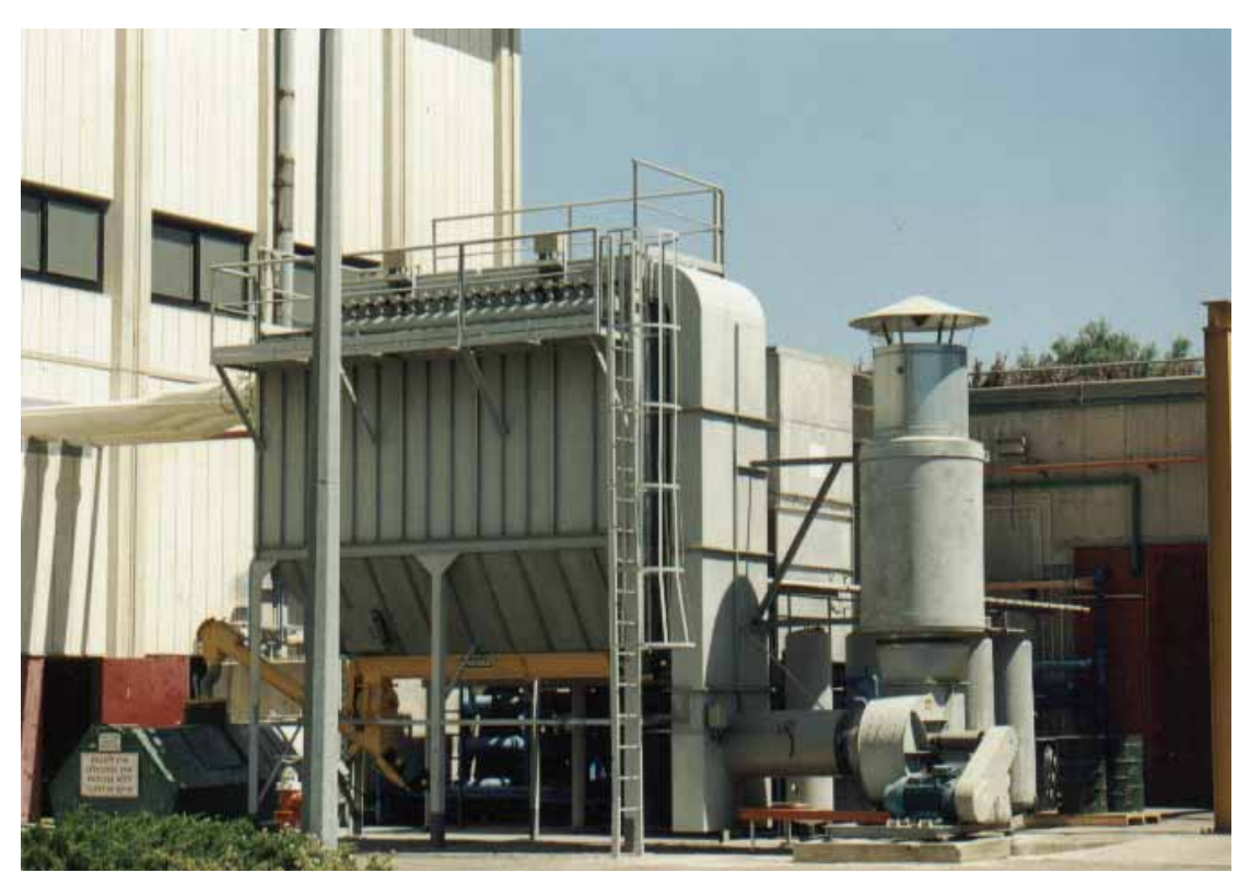
Sand blasting machines dust control