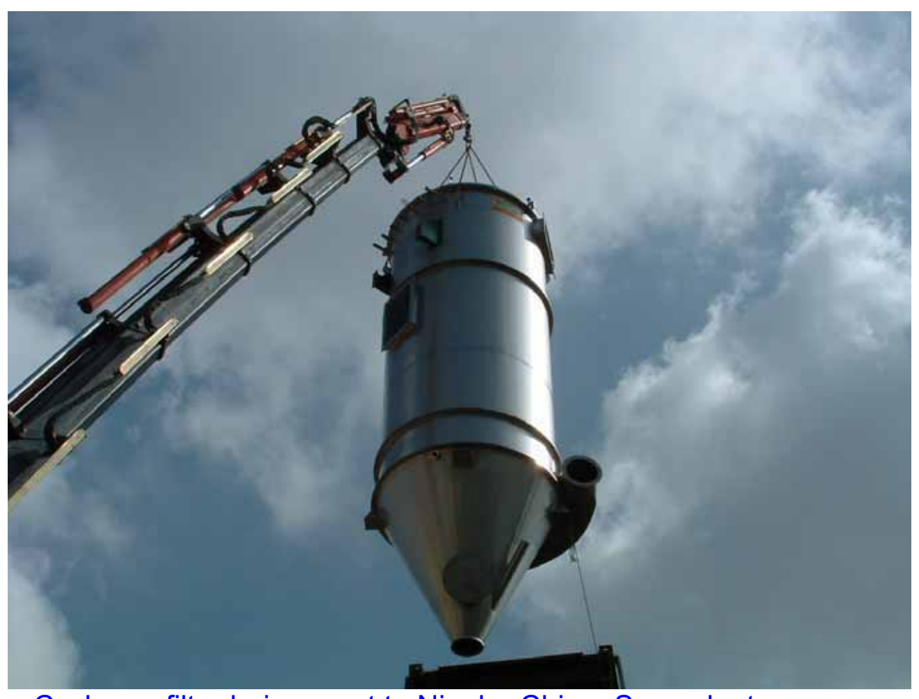
. Cyclone –filter being sent to Ningbo China Soy plant