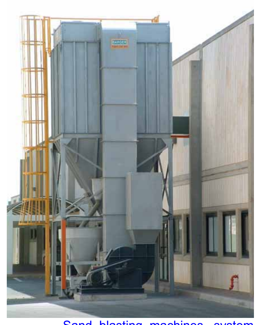
Sand blasting machines system