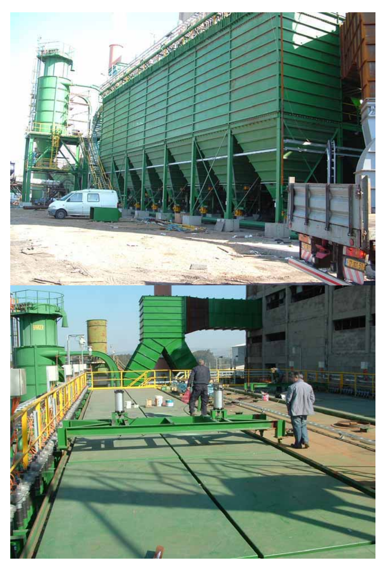
Filter off line type for 60 ton arc furnace 7,016 m² filtration area