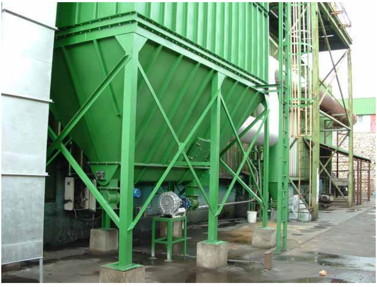
Aluminum Furnace dust and dioxin elimination system 40,000 m³/h