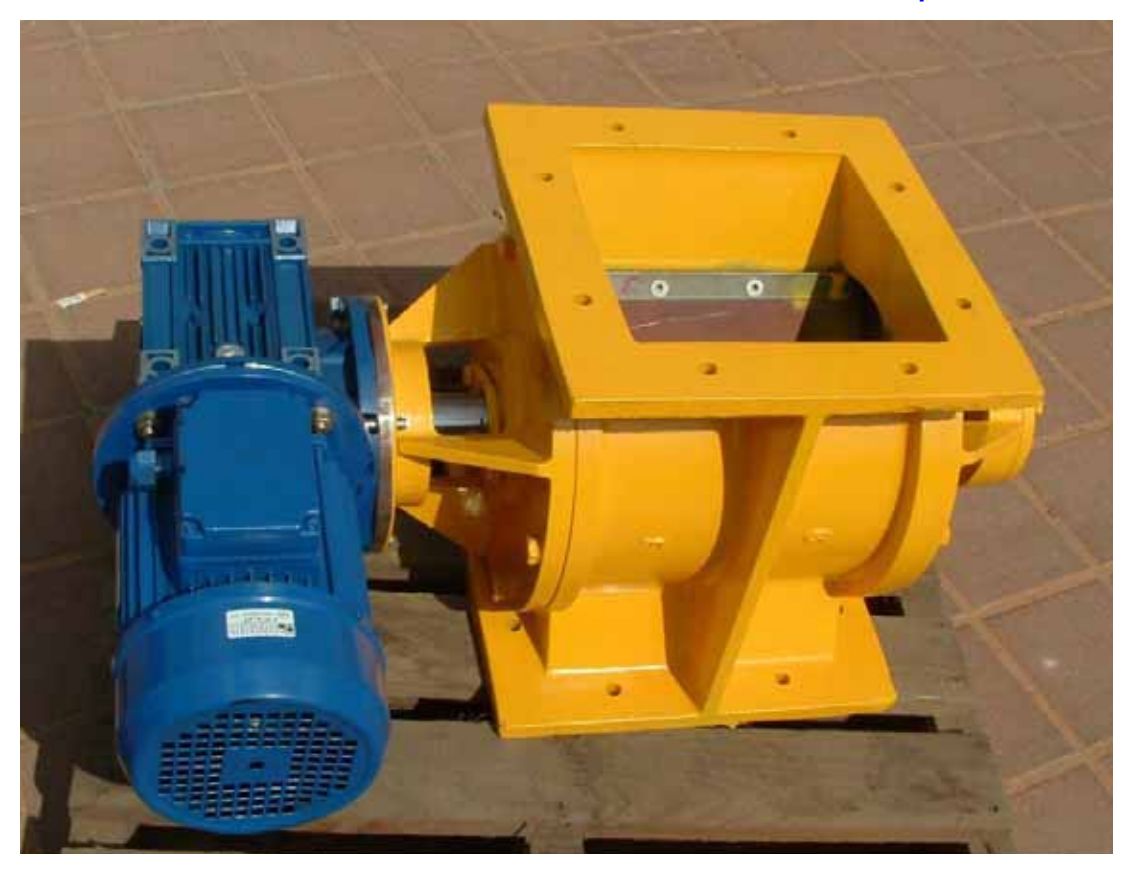
Rotary Airlock cast iron 250/250