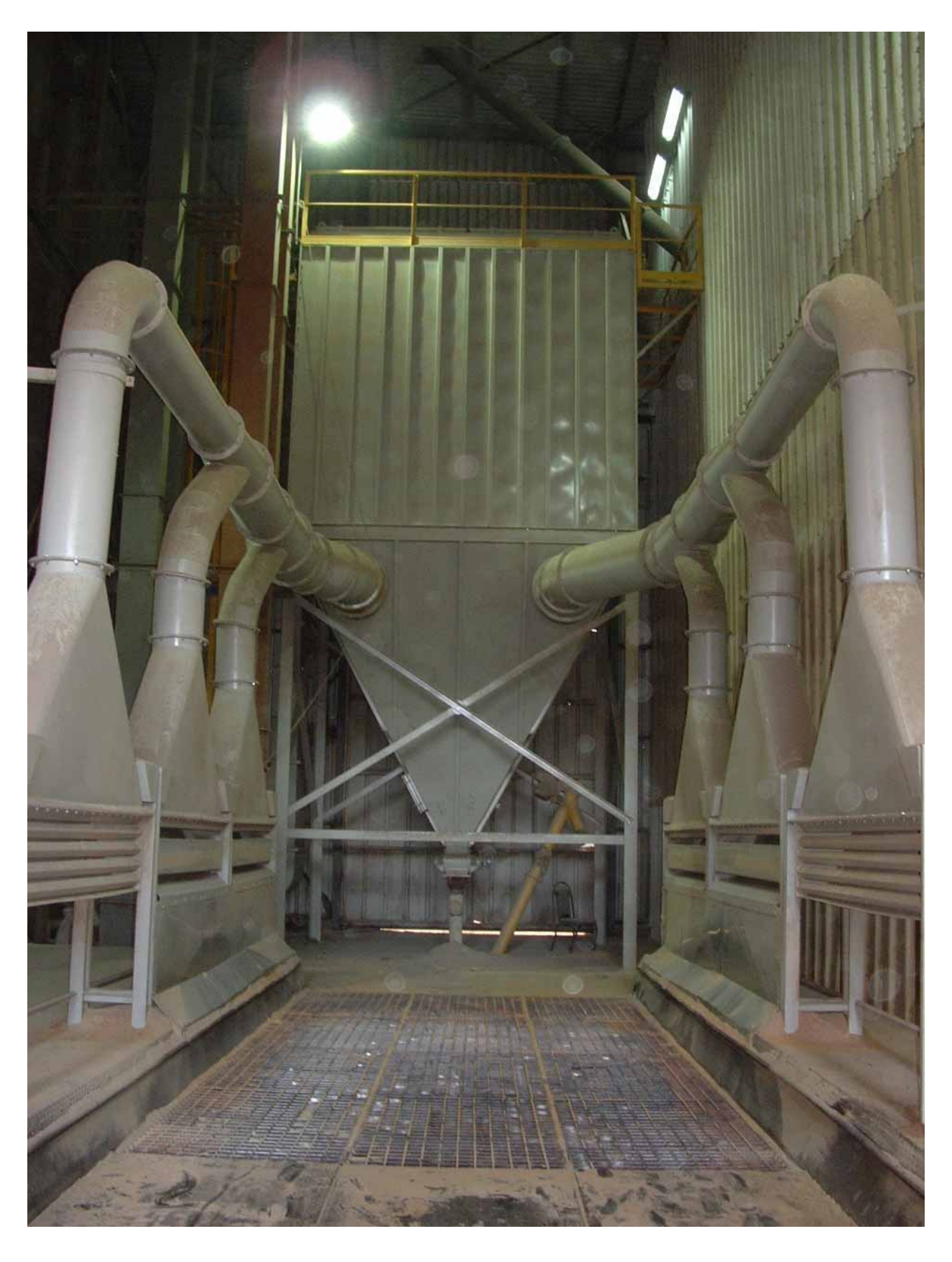
Truck grain unloading pit 65,000 m³/h