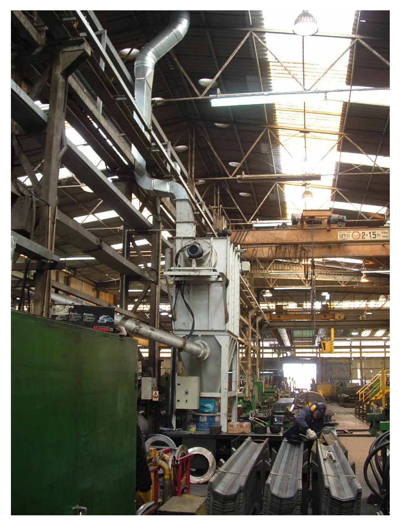
Filter for zinc spraying machine for tubes and profiles