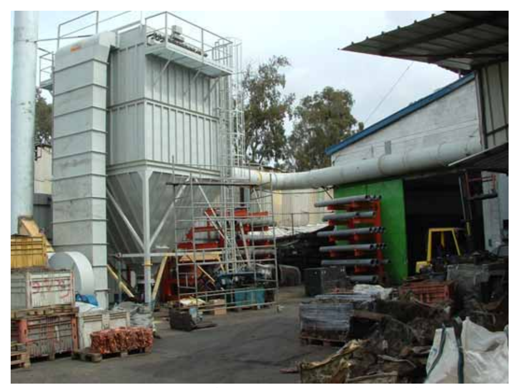
40,000 m³/h system for cooper induction furnaces