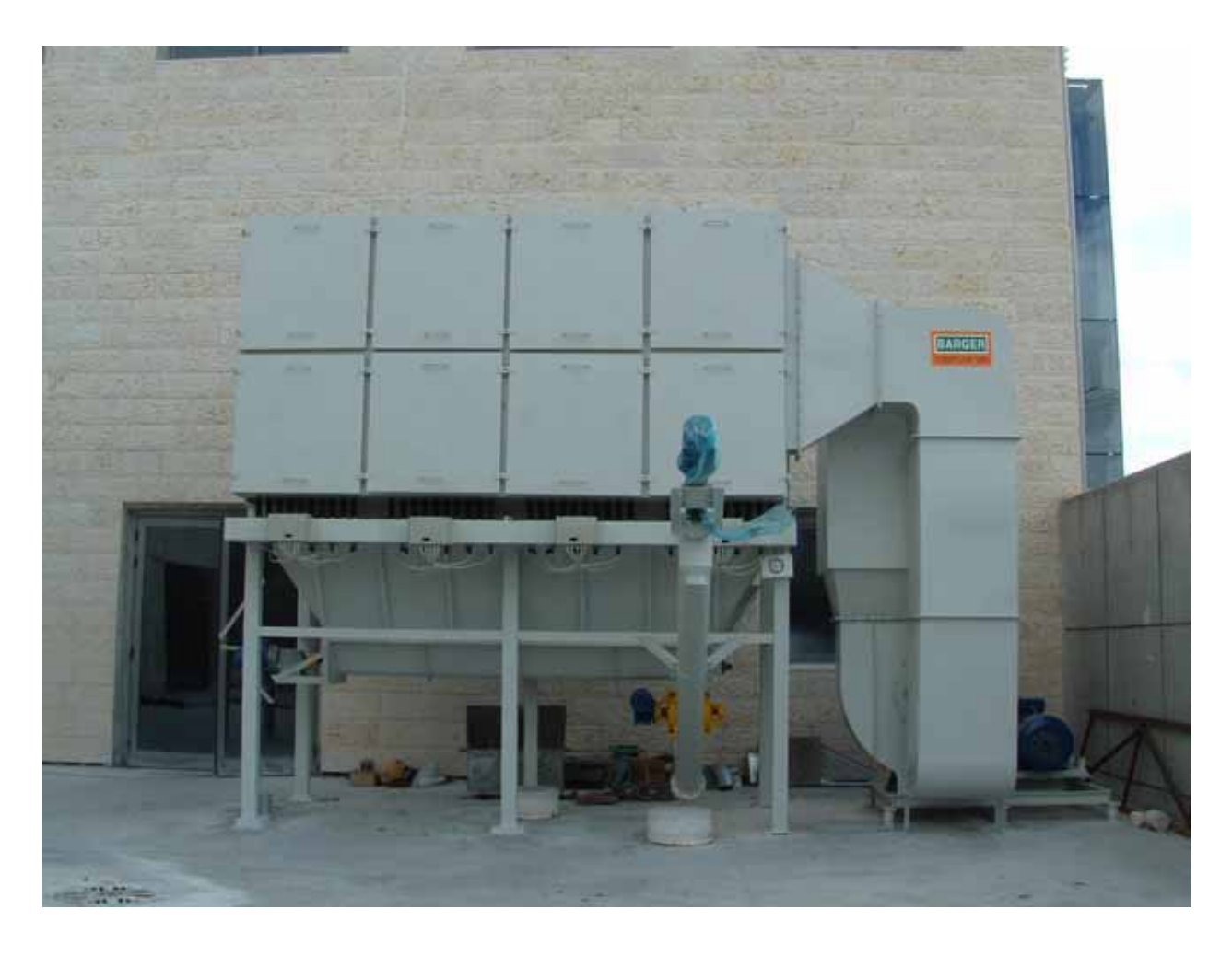
Filter for sand blasting machines using envelope type of filter Bags, side removal, 20,000 m³/h installed at ISCAR plant Tefen.