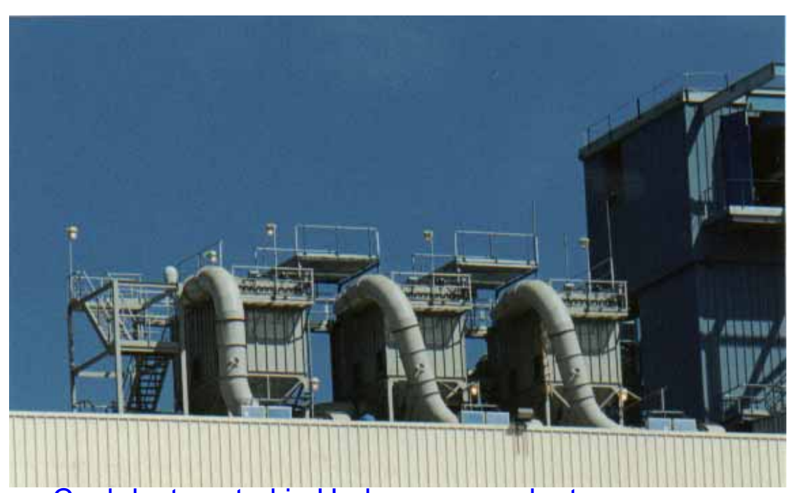
Coal dust control in Hadera power plant And Ruthenberg Power plants