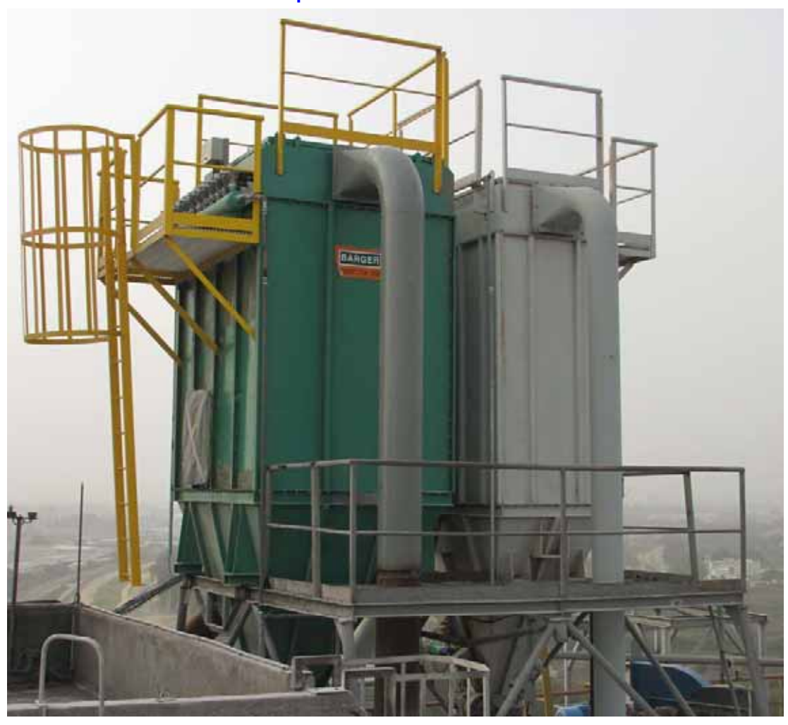
Miloubar Feed will for Crusher