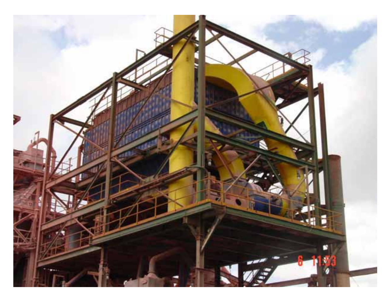
Dead sea dust control for potash 138,000 m³/h