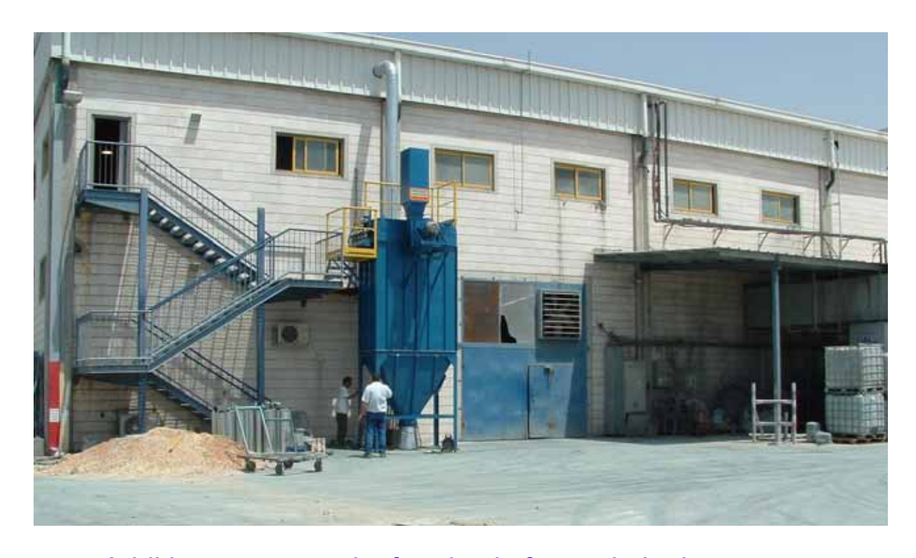
Additive compounds for plastic for sack tipping system