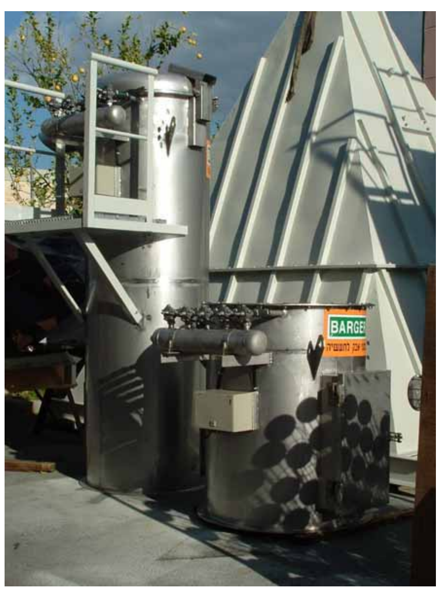
Sugar tipping filters before delivery SS 304