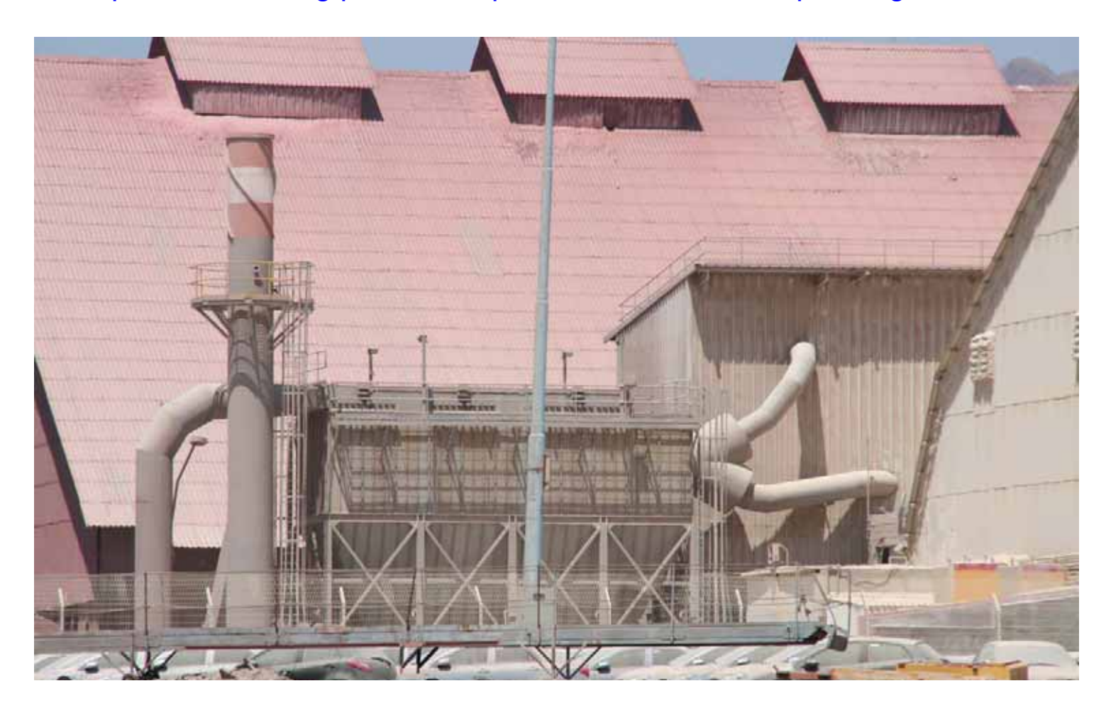
Filter for Phosphate unloading pit Eilat Port 1176 m² Filtration area since 1996