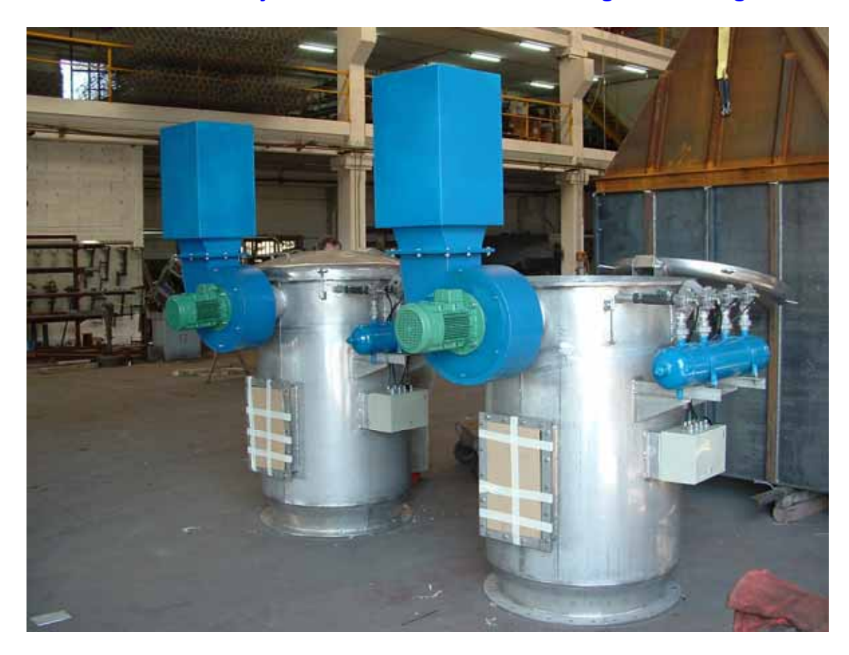
Small pressure filters before delivery SS 316L