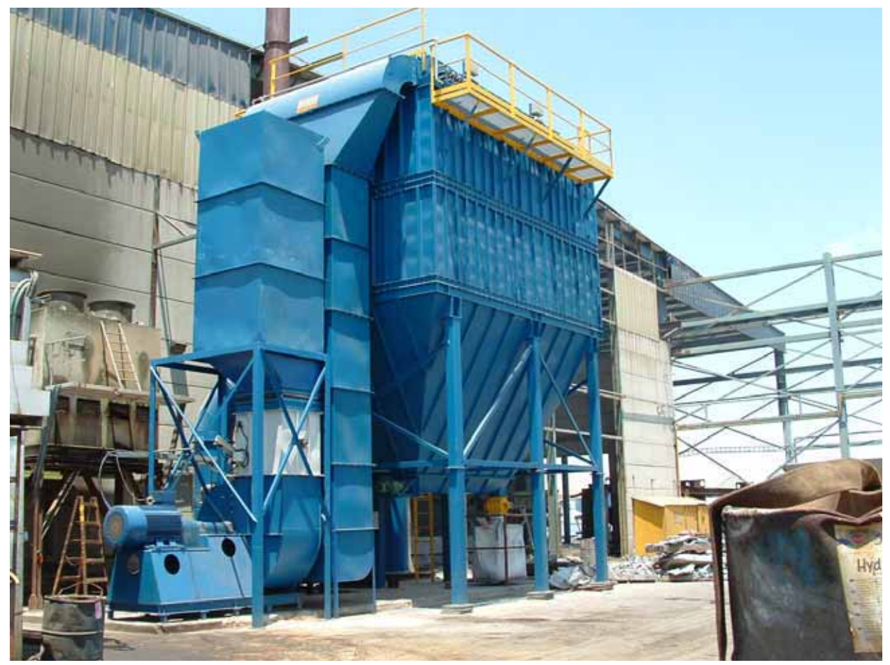
70,000 m³/h system for zinc dust from galvanizing bathtub