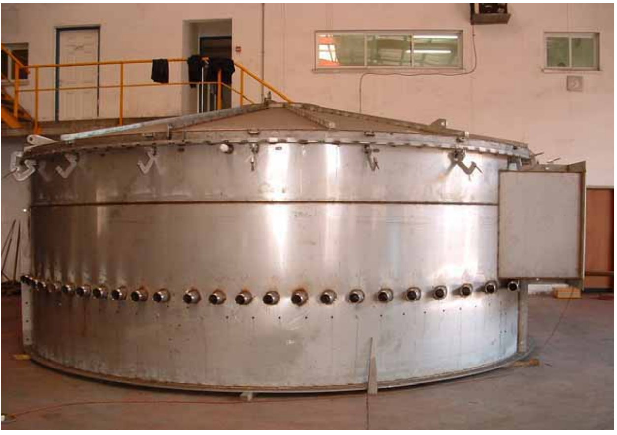
Parts of cyclone filter during manufacturing at our plant application: soy dryer filter. Complete unit is ø 6m 15 m high, 1,920 m² filtration area made of stainless steel 304. Unit sent and installed at a soy plant in Ningbo China